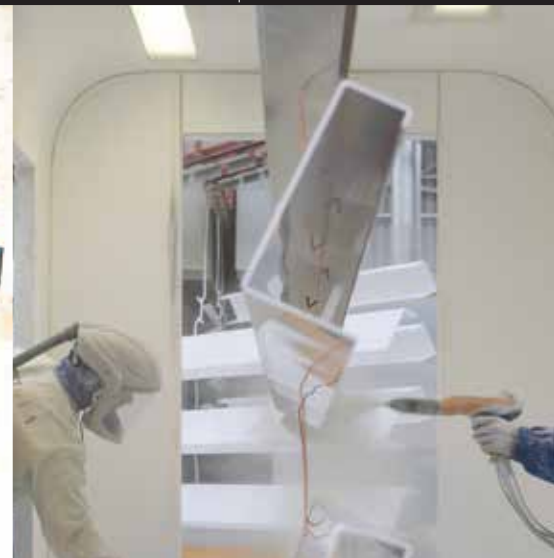
POWDER COATING 08