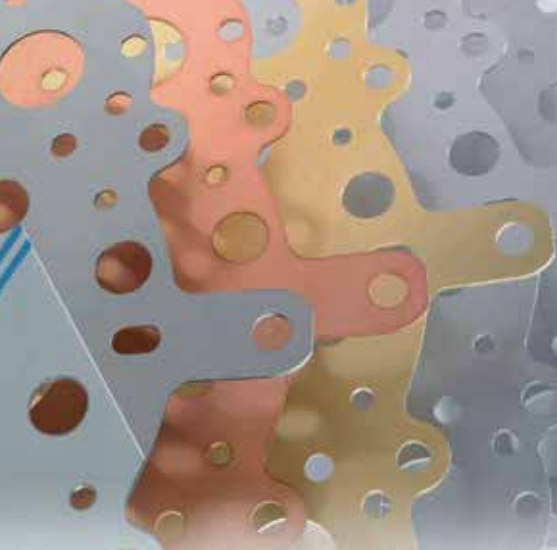
MATERIALS PROCESSING 01