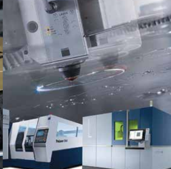
LASER CUTTING 03