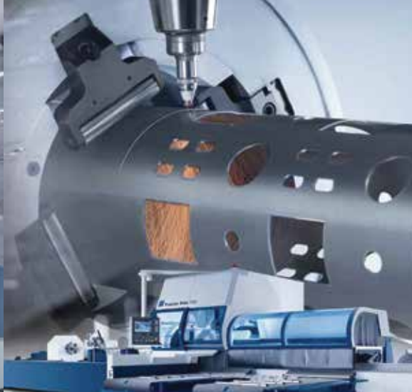
TUBE LASER CUTTING 04