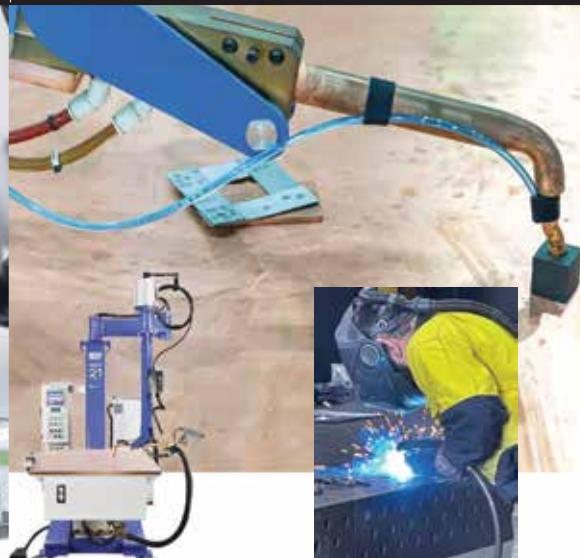
WELDING & SPOT WELDING 07