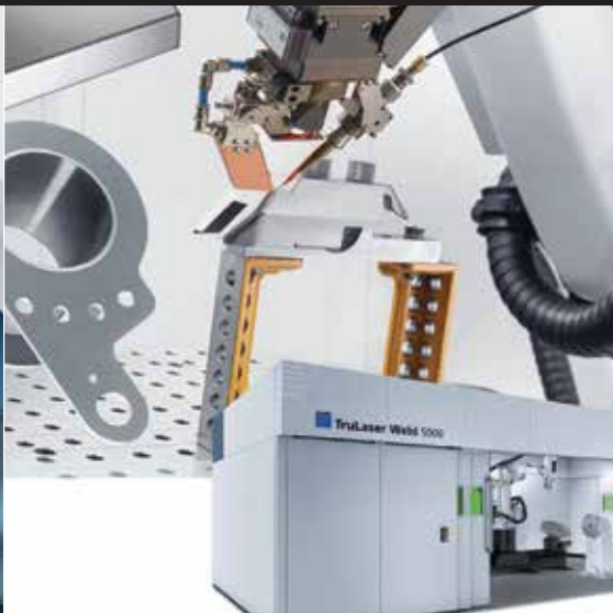
ROBOTIC LASER WELDING 06