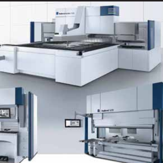
METAL FOLDING 05