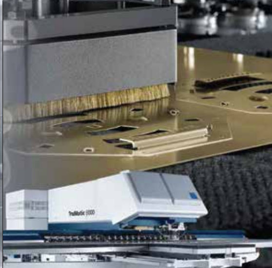
LASER PUNCH 02