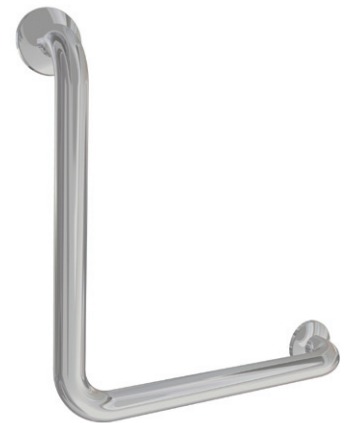
Unit Shown is a Right Hand Ambulant Rail