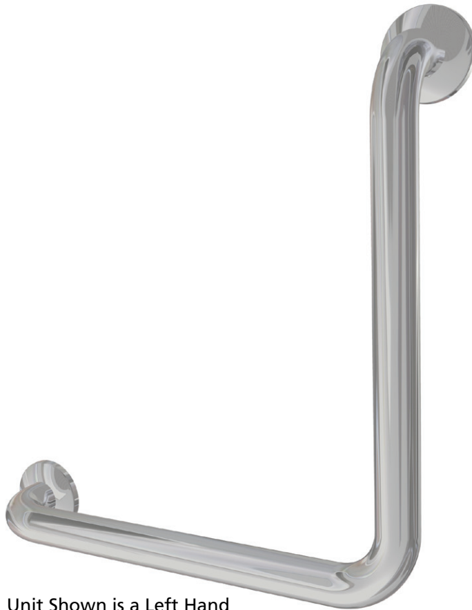
Unit Shown is a Left Hand Ambulant Rail