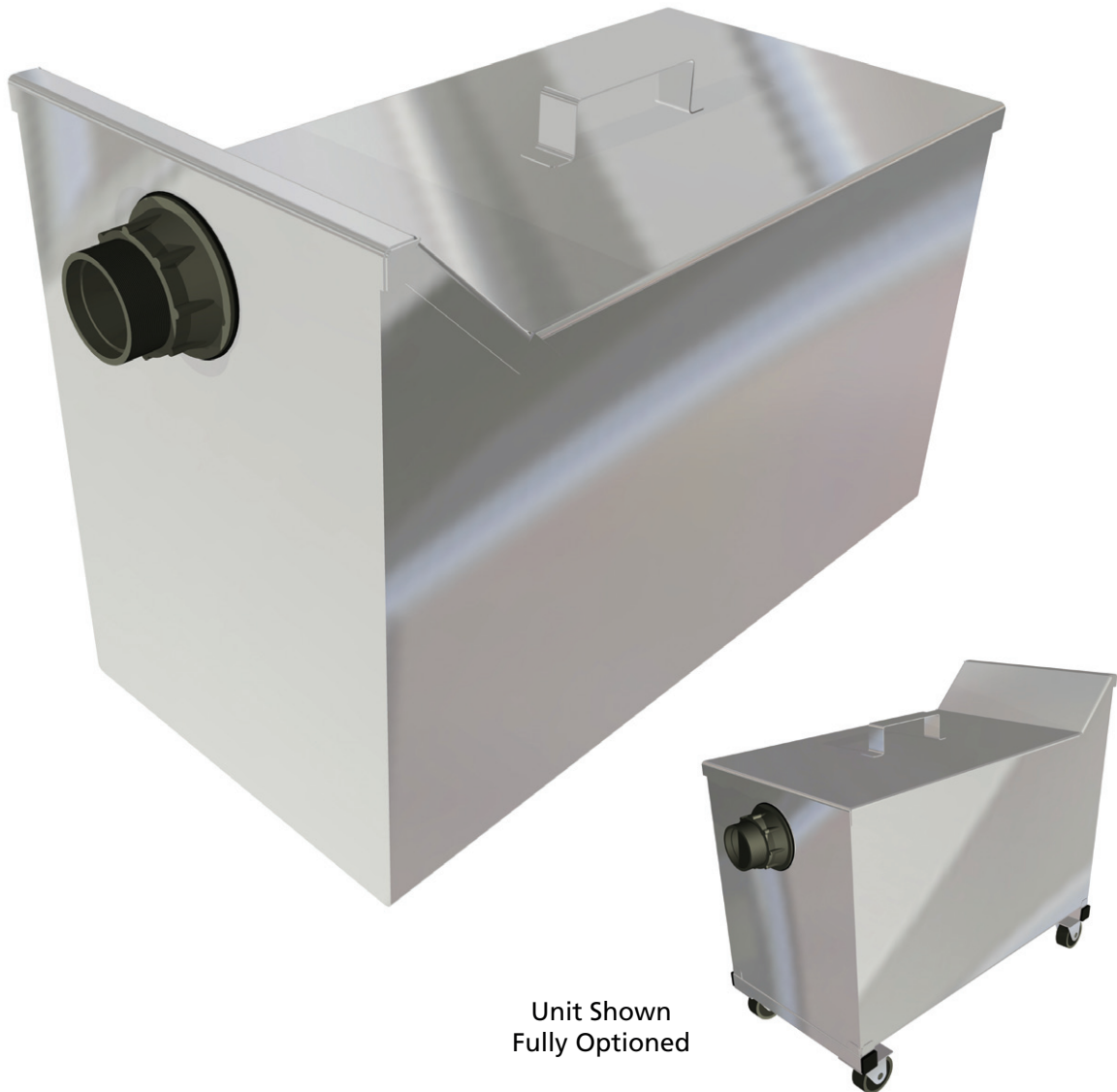
Unit Shown Fully Optioned